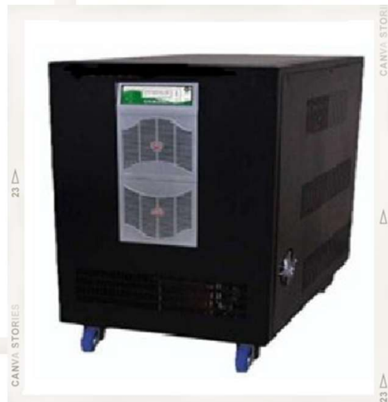
ONLINE SOLAR PCU