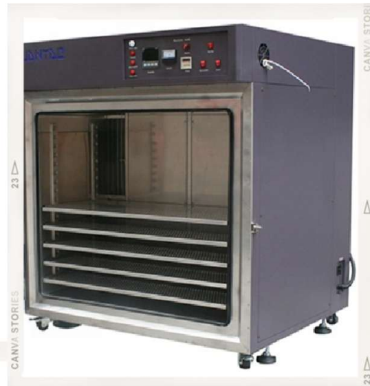
PCB BAKING OVEN